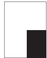
1/4 Pg. Vertical