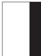
1/3 Pg Vertical